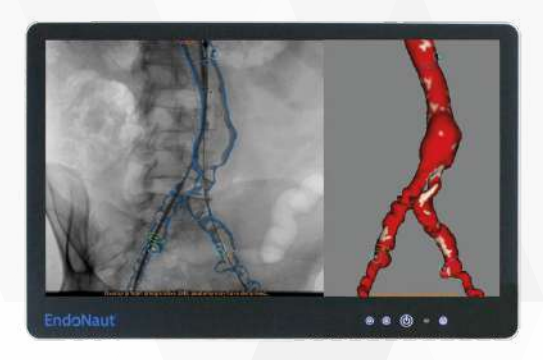
The 3D vascular model deformed after stiff wire insertion is computed by predictive simulation

• Reliable 3D overlay of the deformed vessels