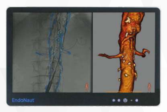
3D overlays, 3D views, and digital zoom tools provide an optimal visual guide