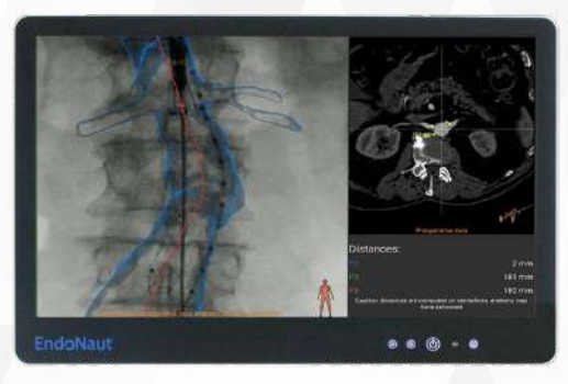
Advanced CT measurement tools and 3D device localization provide data in real time

Decreased X-ray and contrast agent doses