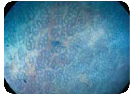
Magnified endoscopic image