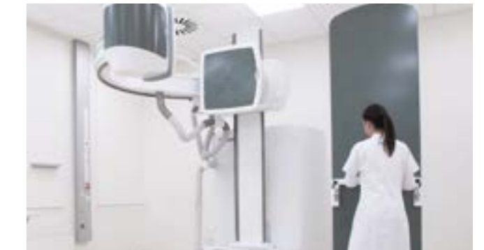
A quantum leap forward in terms of versatility and examination excellence