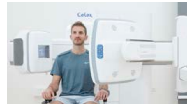
Enhanced benefits of extensive movement ranges