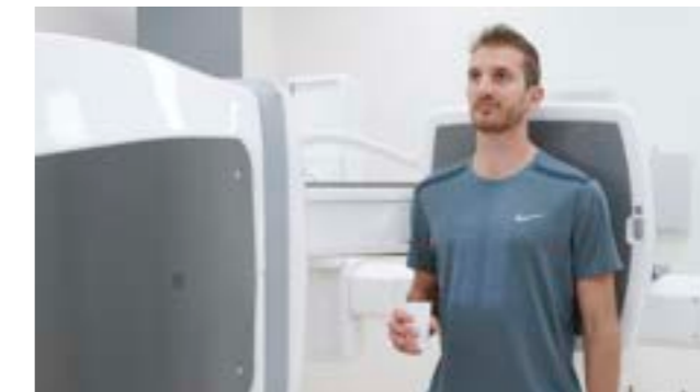
Easy-to-use feature that expands examination possibilities